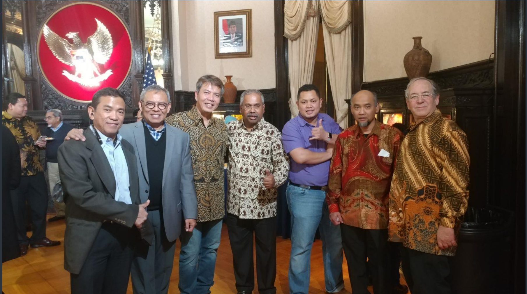
IAA Townhall Meeting 2018